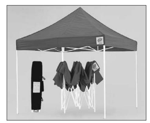
"Sets Up in Seconds!"™

Take time to learn how to provide years of durable and safe use from your E-Z UP® Instant Shelter®. After reading these instructions carefully, if you have any need of assistance, call our Customer Service Department.